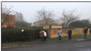
Queuing for vaccine outside Wargrave Surgery