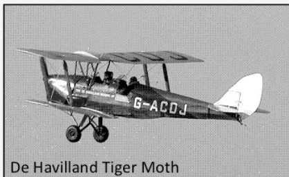
De Havilland Tiger Moth